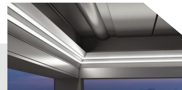
Dimmable LED lights applied on transoms, louvers and posts providing sufficient and stylish lighting at night.