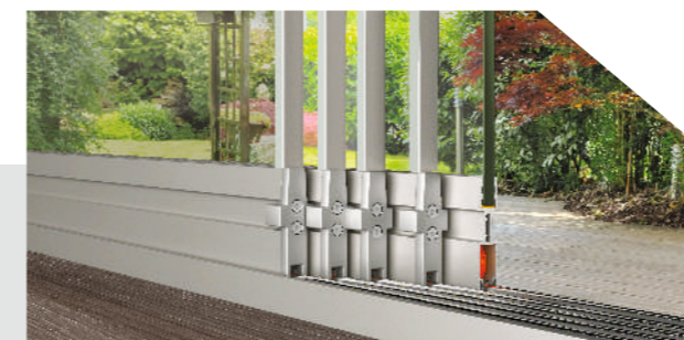
Minimal glass sliding system , optionally equipped with a ZIP Screen on the same side, enhancing the overall living experience.