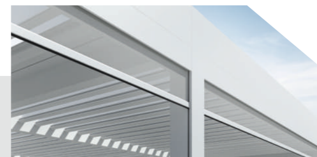
Fully integrated & automated ZIP Screens , offering an elegant solution for vertical shading.