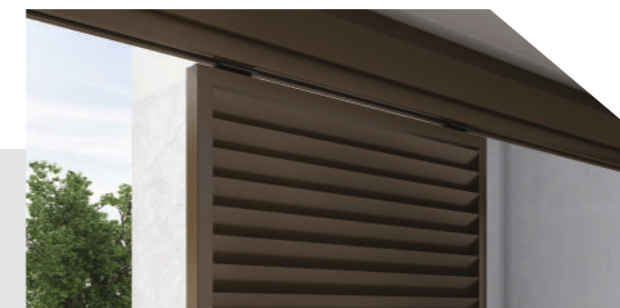
Top-hung sliding shutters , ideal for decorative shading solutions.